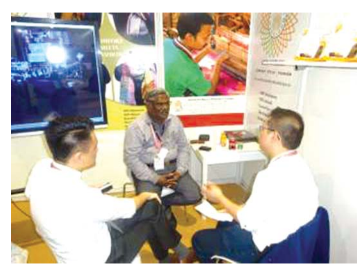
Council Official meeting with fair authority