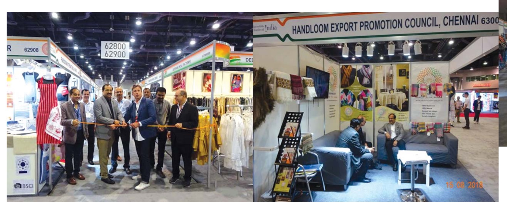
Inauguration of Council's pavilion