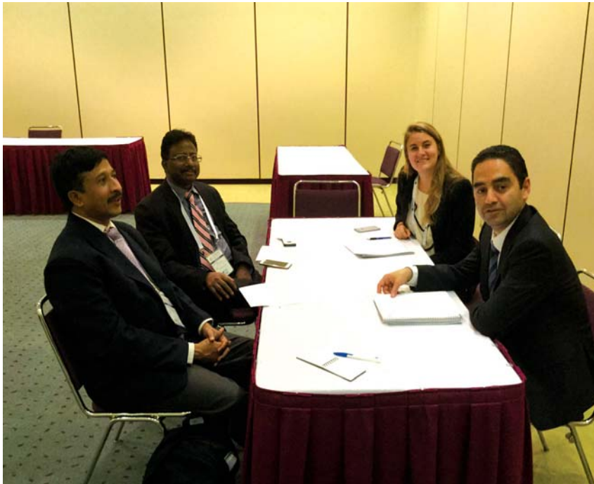
Discussion with fair authorities