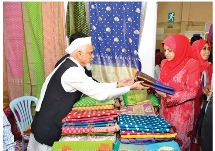
Haji Mohd. Farooque & Co.

Few photographs of PM's Advisor visit to our member participant's stall.