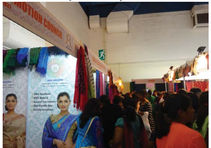
Visitors at Participant stand