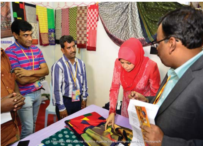
Pochampally Handloom Park