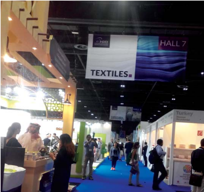
Aisle (Hall No. 7)