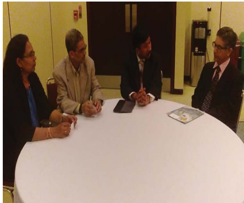
Discussion with CGI officials